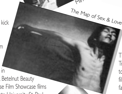
The Map of Sex & Love