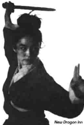
New Dragon Inn

After assaulting his superior officer, well-decorated cop Bill gets reassigned to the less glamorous Emergency Unit. There, Bill gets on the trail of escaped criminal Professor, and his accomplice Birdie.